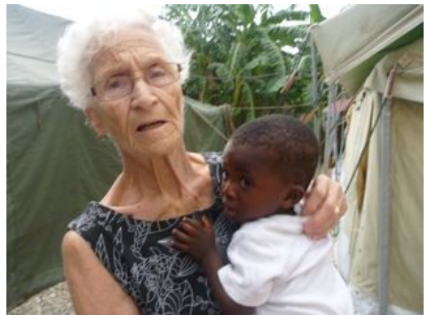
reprinted from a previous newsletter.