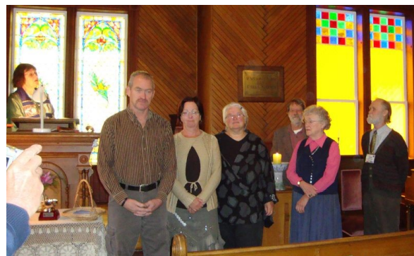
Board Installation, September 26